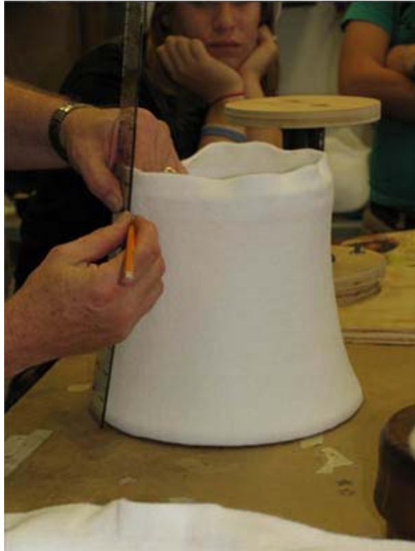
10. Fit and mark the placement of the crown on the brim.